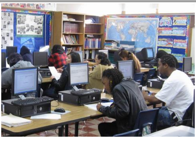
California School Parent Survey

CAASPP testing will be administered beginning in April. Learn how to prepare. Page 2