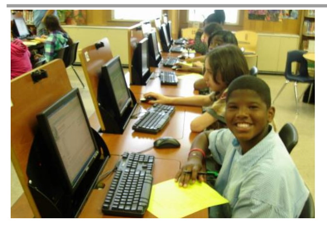
CAASPP Testing Begins April 11th

The latest West Contra Costa Unified School District news in assessment, data, and the Local Control Accountability Plan (LCAP). Subscribe to the online version at bit.ly/access-news.